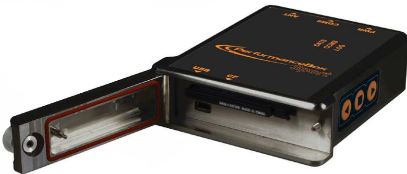
PerformanceBox Sport (with door open)